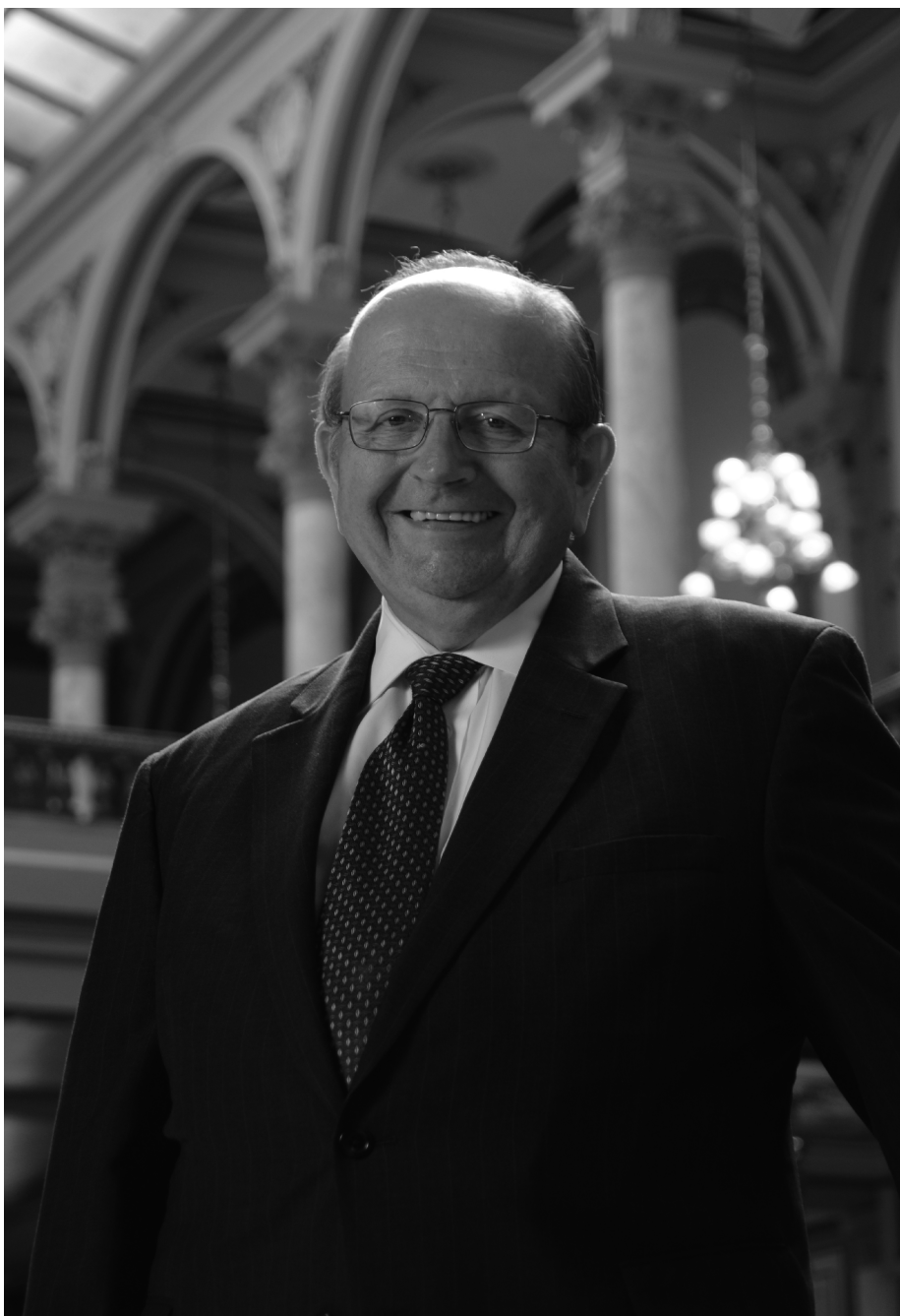
JUSTICE BRENT E. DICKSON